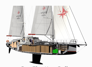
Our Floating Cellar

Schooner type 80 feet long 4 Pro Sailors