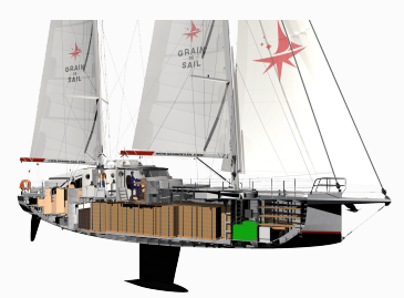
Our Floating Cellar

Schooner type 80 feet long 4 Pro Sailors