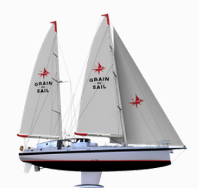
Our Cargo Sailboat

Sail shipped cert' Unique Trip N° Dedicated website