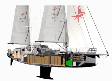
Our Floating Cellar

Schooner type 80 feet long 4 Pro Sailors