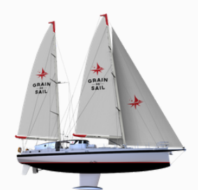
Our Cargo Sailboat

Sail shipped cert' Unique Trip N° Dedicated website